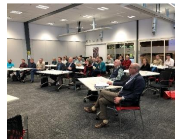
Audience of the DACG symposium